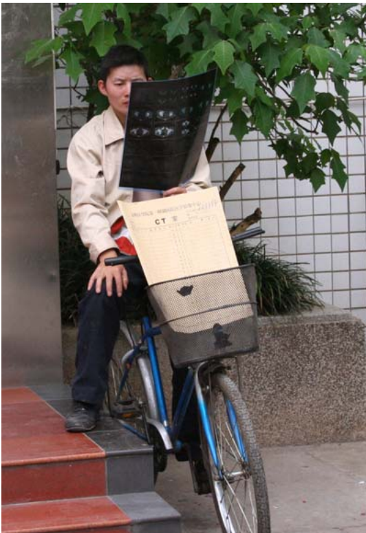
Patient reviewing his own CT scan